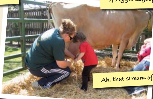
Ah, that stream of milk.