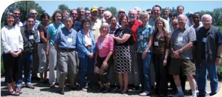
Participants in the June 2008 strategic planning retreat.

Animal Science department faculty attended day-long retreats in June 2008, December 2008 and June 2009 to work on strategic planning. The goal is to develop a visionary framework to shape the department's teaching, research, and outreach in the 21st century. Among many challenges are providing a sound education for burgeoning student numbers, planning for replacement of faculty who will retire in the next 5-10 years, and funding research and the department's extensive animal facilities in the face of a difficult economy. An ad hoc committee has already crafted a proposal to revise the curriculum offered by the department. New working groups will be formed to expand the proposal and develop an implementation plan. Another committee is generating an integrated plan for animal facilities. Members of the department are continuing to work together to refine and shape the ideas emerging from the retreats and these committees.