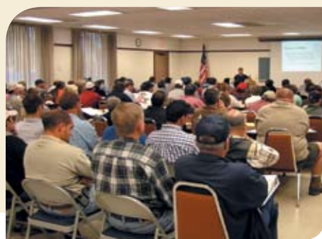
Twenty-one compliance workshops were held during a 2 month period in fall 2007.