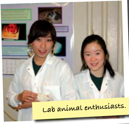
Lab animal enthusiasts.