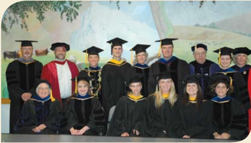
Graduate degree recipients who conducted their research in the department gathered with faculty after a pre-graduation reception in the Weir Room in Meyer Hall, June 2008.