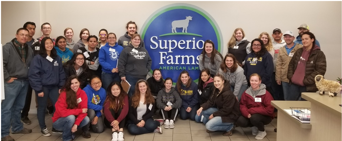
- Students, faculty and staff at Superior Farms -