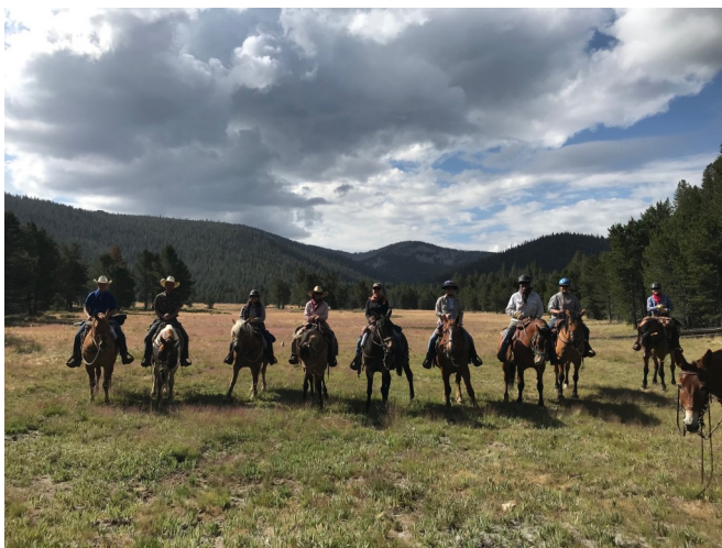
- 2018 UCD Pack Trip crew -